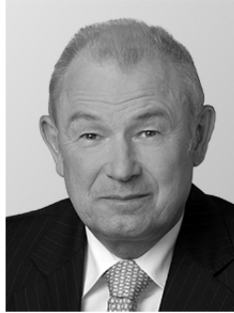
Dr. Günther Beckstein