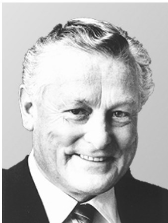
Dr. h. c. Max Streibl