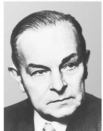
Dr. Hans Ehard