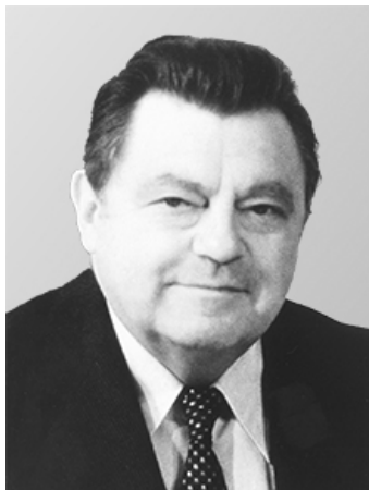
Dr. h. c. Franz Josef Strauß