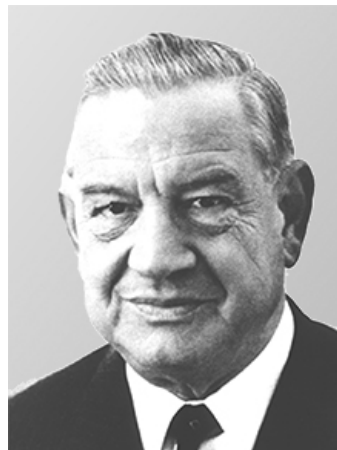
Dr. h. c. Alfons Goppel