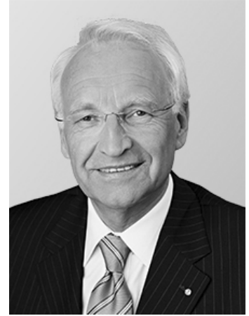
Dr. Edmund Stoiber