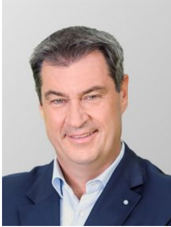
Dr. Markus Söder, MdL